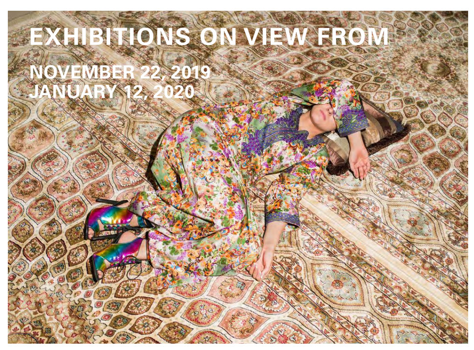
Farah Al Qasimi's Open Arm Sea and Contemporary Practice , an Exhibition of Texas Undergraduate Work Image: Farah Al Qasimi, M Napping on Carpet , 2016